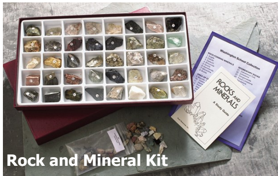
Rock and Mineral Kit