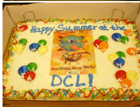
BELOW: Over 100 children and their parents joined us for activities, balloons and cake at our Summer Reading Program Kick-off Party on Monday, June 27.