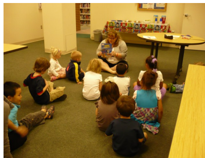
LEFT: Dozens of children celebrated Thomas the Tank Engine and Friends at our special storytime and craft event on Friday, June 17. The first of many summer reading programs.

During this year's Summer Reading Program, the Friends of the DeWitt Community Library are sponsoring special guest entertainers. Each week from July 1 thru August 5th, we'll have a show with animals, music or magic. Gather in our DCL Friends Meeting Room at 2:00 pm for these events. Attendance is first come, first served, so come early!